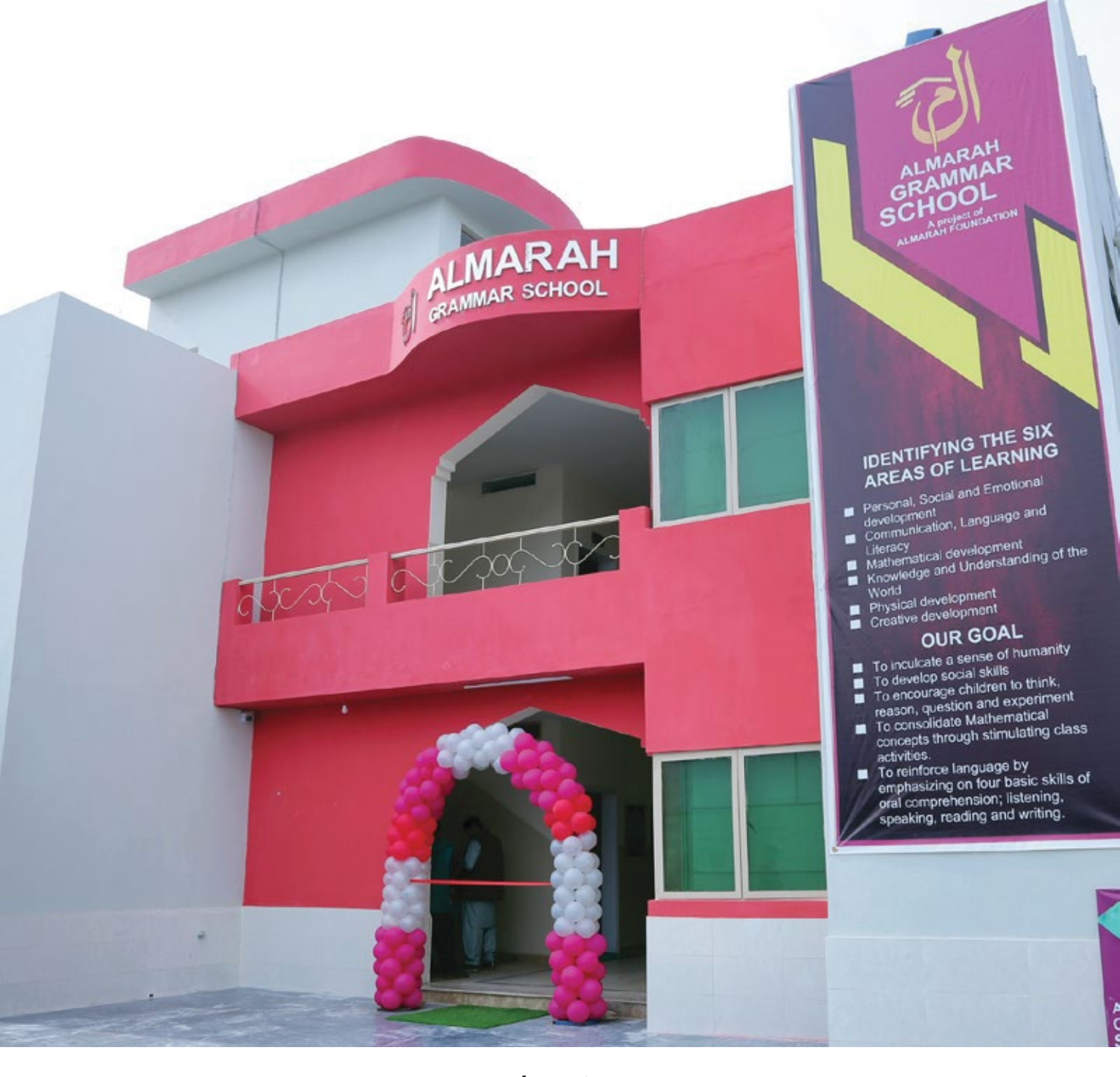
Almarah Grammar School, 132/B Rajpoot Town, Canal Road, Lahore