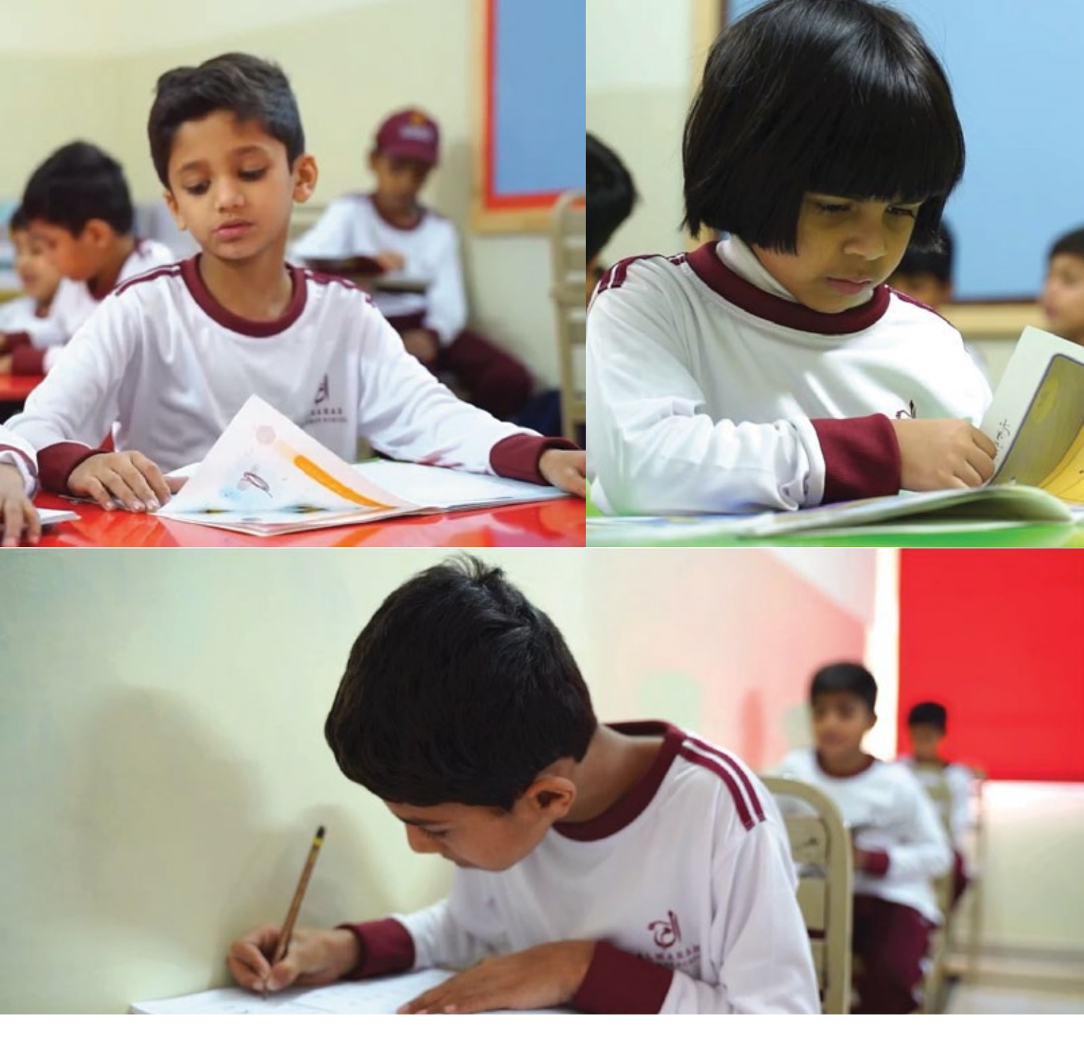
Students of Almarah Foundation